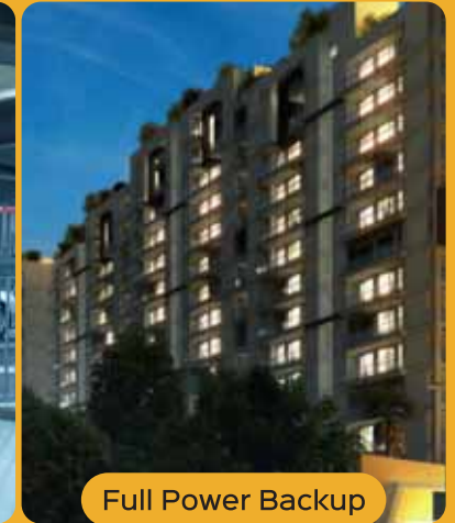
Full Power Backup